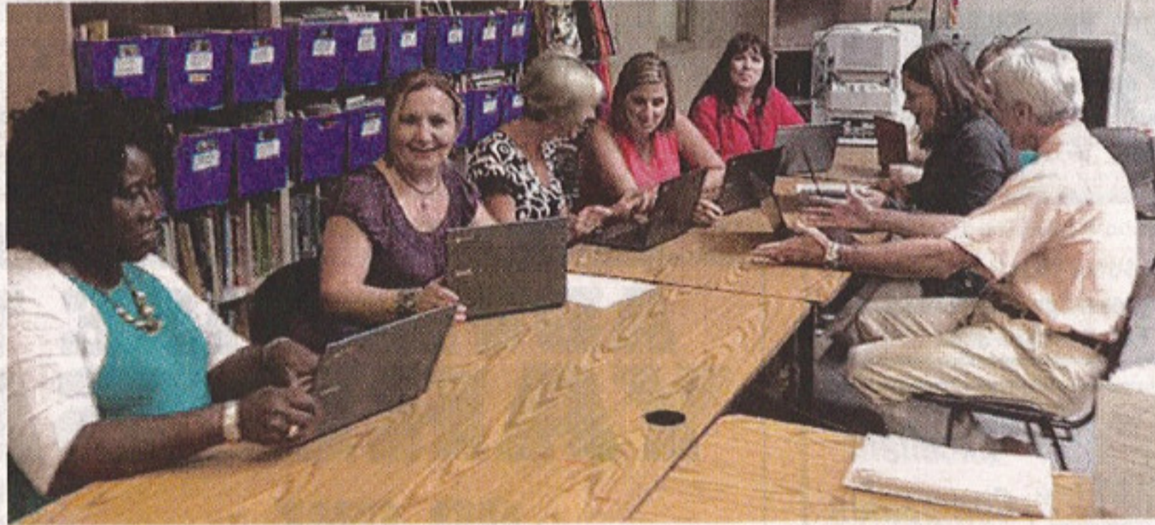
Staff members at St. William Catholic School participated in a Google professional development session in June to learn this new technology.

'Tools 2 Go' is our WECDSB version of Google and is the platform in which they communicate with each other, students, and parents.