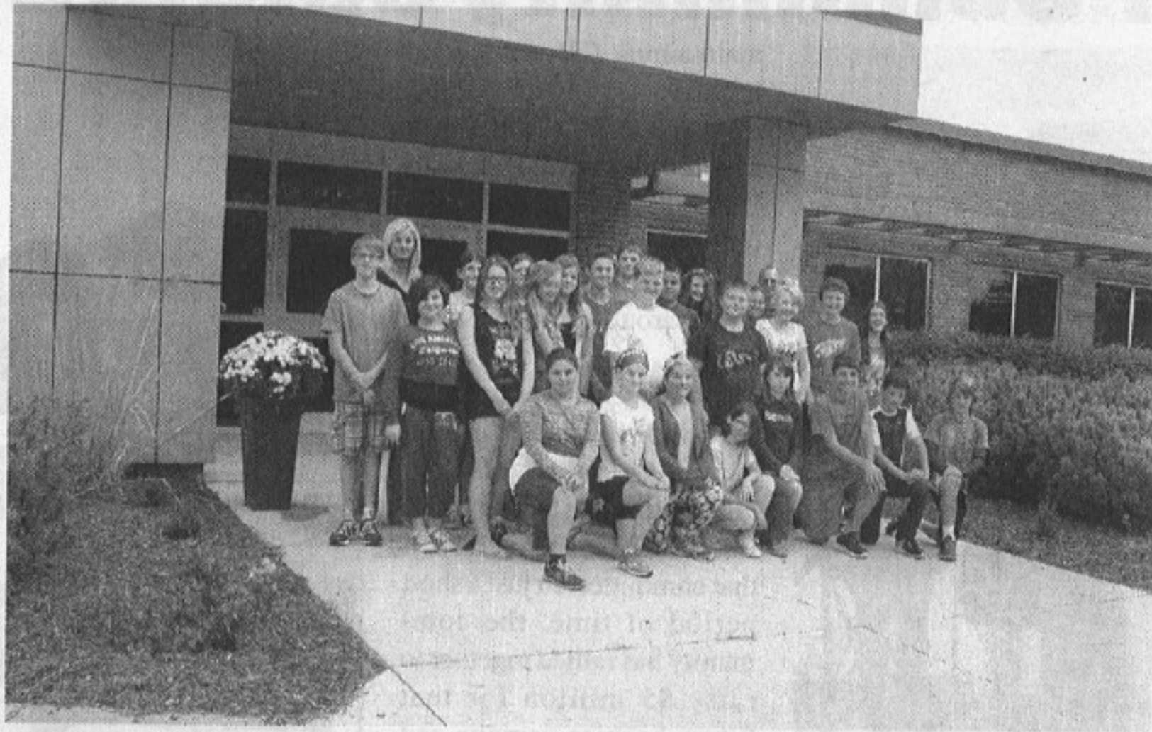
New beautification efforts around the building helped to kick off the new school year at St. Anthony. Pictured above are some of the grade 8 students who will be attending an upcoming Muskoka Woods field trip in front of some of the beautification work.

Members of the school's Parent Council have also been working hard in partnership with the school for some outdoor beautification efforts which saw new trees, shrubs and flowers planted along with the laying of fresh mulch. The front of the school has received some of these efforts along with the environmental area in the