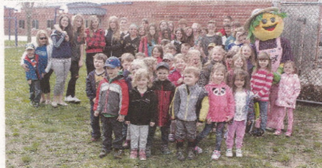
The St. Anthony Catholic Elementary School grade eight classes presents the paper birch trees to the junior and senior kindergarten classes. One of the grade eights said, "As the kindergartens grow up to be their best selves, these trees will grow alongside them."