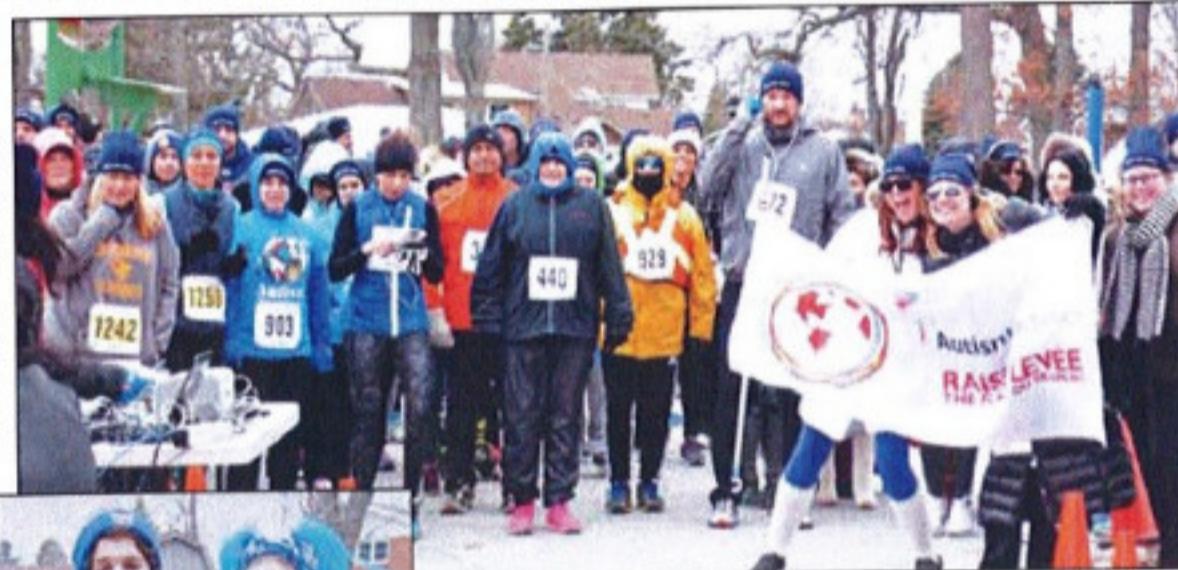
Above: Nearly 200 runners and walkers get set for the start of the 5-10km Run/Walk for Autism Awareness Sunday at Seacliff Park.