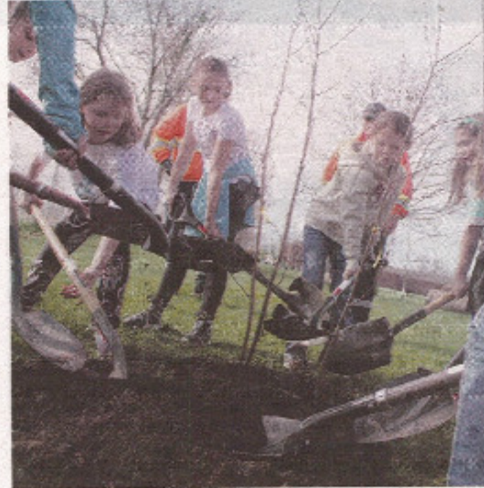
The Eco-Team of Harrow Public School got to work planting their newest addition to the school property. This paper birch, also known as a white bird, will reach up to 60 feet tall when it is fully grown and can last around 140 years.