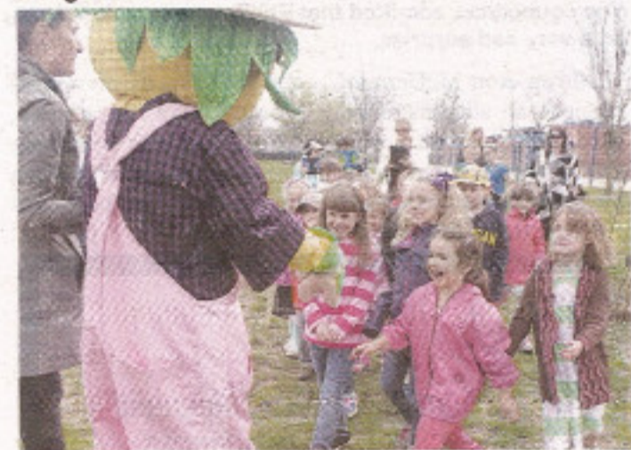
Petunia is a very special member of the Communities in Bloom committee and can be spotted around Essex at various events. The junior and senior kindergarten classes of St. Anthony Catholic Elementary School were very excited to see their flowery friend again.

For Earth Day on April 22, TD Friends of the Environment Foundation and the Town of Essex and its