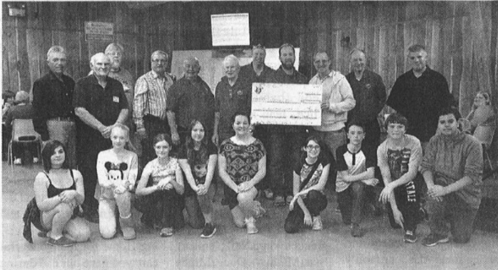
Knights of Columbus Council 5350 donate $2,300 to St. Anthony School so that they can participate in the Canada Wonderland engineering contest, to be held May 6th. Students will be constructing working scale models of rollercoasters, in pairs, to prescribed technical requirements; top three of which will compete at the Ontario competition held at Canada's Wonderland.