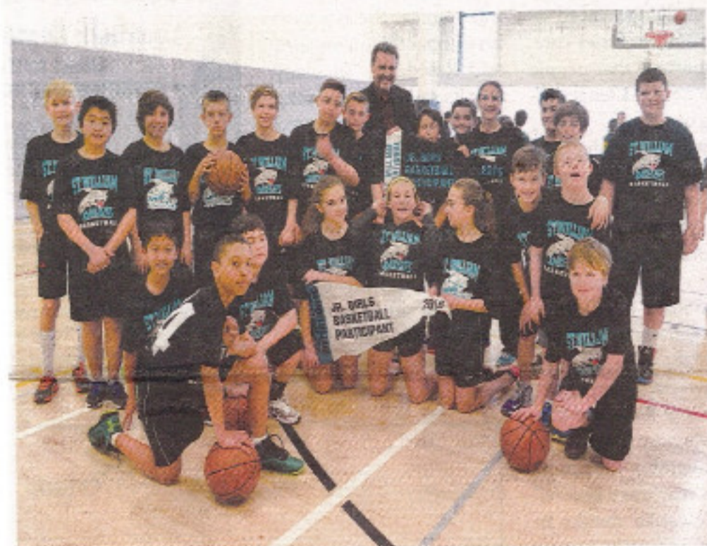
Photo top; A group photo of all the participants in last weeks basketabl celebration held at the Atlas Tube Centre. Photo left; a picture of the host St. Williams Wildcats squad. Over 100 students took part in round robin play.

Over 100 student athletes, ages 9-12 took the court at the Atlas Tube Centre to celebrate the game of basketball, hosted by the St. Williams Wildcats.