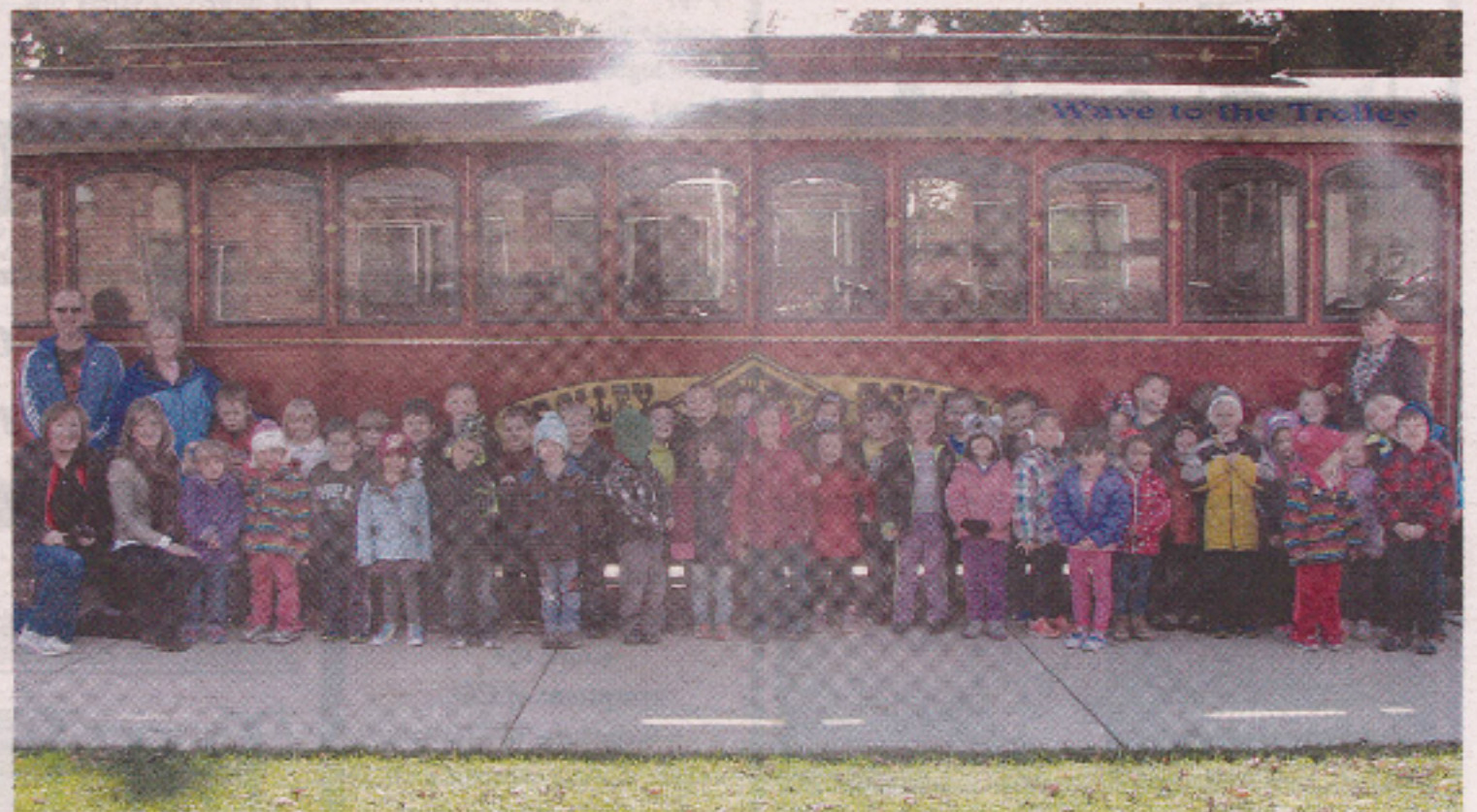
St. Anthony School in Harrow recently hosted its annual Walk and Green-a-Thon. Students broke their previous fundraising record this year by raising more than $5,200 for their school.

Last week, St. Anthony delivered on the many incentives that were offered to students as an encouragement for fundraising. The prize incentives included pizza parties for top fundraising classes in each division, $300 worth of Spitfire tickets, a luncheon for all those students who raised more than $50 in pledges, a movie and popcorn in the gym for the top division as well as Chapters gift cards for top fundraising individuals.