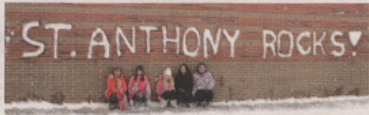
Students of all ages at St. Anthony Catholic School in Harrow participated in their annual snow sculpture contest on Monday, January 12 including these senior students who used the school's brick wall in their display.