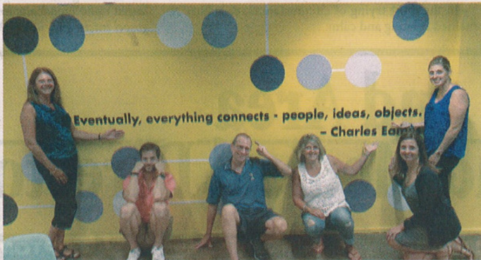
A coding workshop was held for staff members last week.