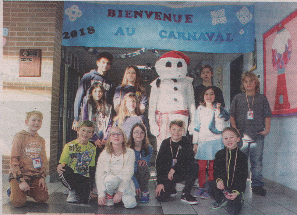
The whole school had the chance to participate in the first-ever Quebec Winter Carnival held at St. Anthony Catholic Elementary School. Bonhomme Carnaval himself was there to celebrate with the students.