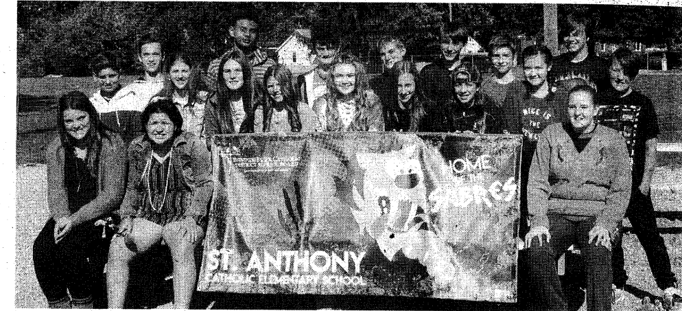
The Grade 8 students of St. Anthony Catholic Elementary School are heading off to Muskoka with the other Grade 8 classes in their family of schools. This Grade 8 trip will encourage the students to take part in a wide array of fun and challenging activities. This includes leadership and team-building exercises along with heart-pounding fun on ziplines, exploring nature through hikes, cycling and canoeing and trying their hand at archery. The trip will run from October 10 to the 13. This is a long-time school board tradition and helps to celebrate the Grade 8's achievements over the course of their elementary school years.