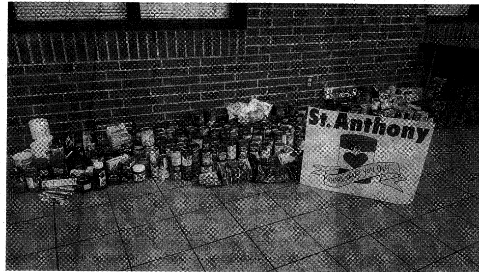
The St. Anthony Catholic Elementary School hosted their first can drive of the school year to donate to the local for banks. The Thanksgiving Can Drive brought in over a hundred non-perishable and personal hygiene products in just a short amount of time.