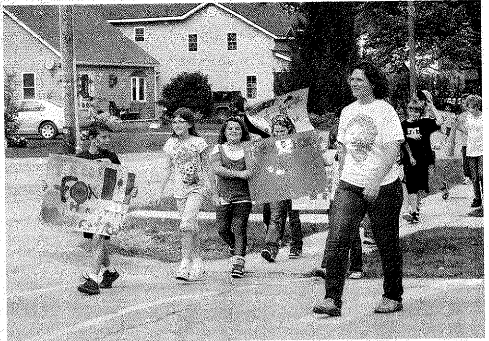
Students from St. Anthony School marched around the school block and down the streets of Harrow last week during their annual Terry Fox Walk, carrying hand-made signs and banners.