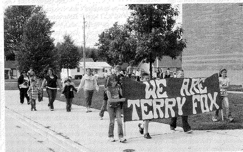
St. Anthony Catholic Elementary School in Harrow held their annual Terry Fox Walk last Friday, September 28. The school's students raised around $200 in support of the local chapter of the Canadian Cancer Society.