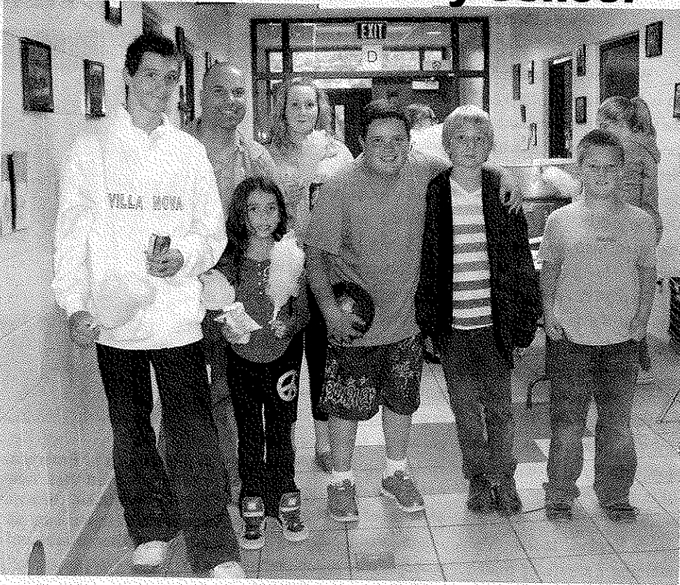
St. Anthony Catholic Elementary School in Harrow held a meet the teacher barbecue last Tuesday, September 18 to welcome former and new students along with their families to another school year. Despite the cloudy skies overhead and rain, the event was a big success, attracting large crowds of students and their families to the school.