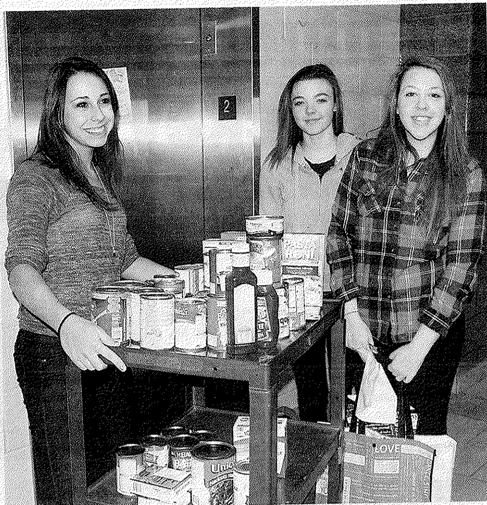
ABOVE: Ste. Anne students are pictured, collecting cans for the area's needy.