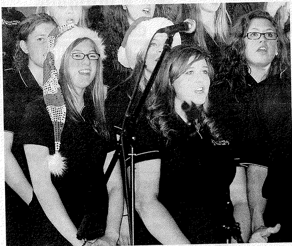
Choir members perform for parents, staff, and students during Ste. Anne's Christmas concert last month.