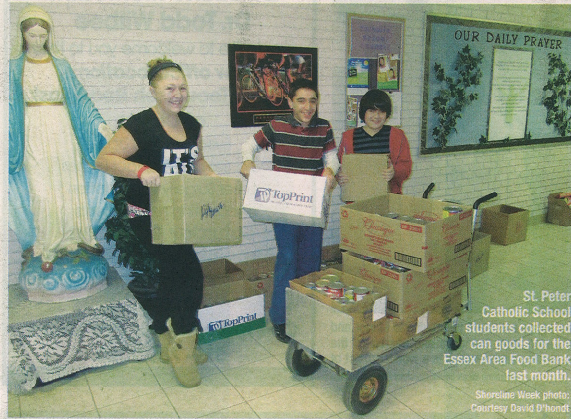
St. Peter Catholic School students collected can goods for the Essex Area Food Bank last month.

Can goods collected for Essex Area Food Bank; monetary donations to Downtown Mission