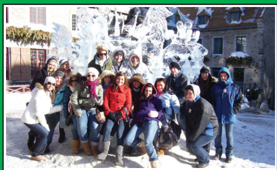
St. Thomas of Villanova French Immersion students at the Carnaval de Québec.