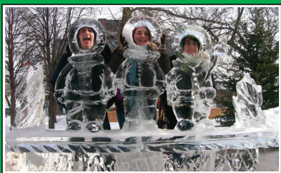
St. Anne's French Immersion students in Quebec City for the Winter Carnival